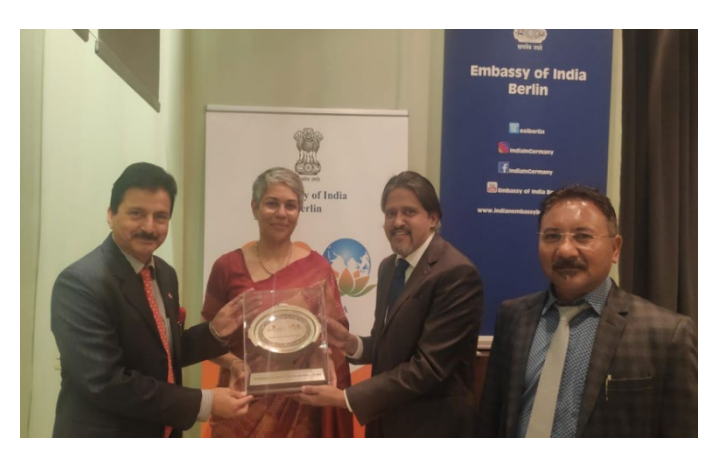
The Associated Chamber of Commerce and Industry of India (ASSOCHAM) mounted a High-level business delegation to Germany on 25<sup>th</sup> – 26<sup>th</sup> May 2023. ASSOCHAM's delegation had productive B2B engagements with industry members from Germany.

The business engagements were organized with the Indian Mission in Berlin followed by The Federation of German Industries (BDI), Germany Trade and Invest (GTAI), Ministry for Economic Cooperation and Development and Ministry for Economic Affairs in Berlin, Germany.